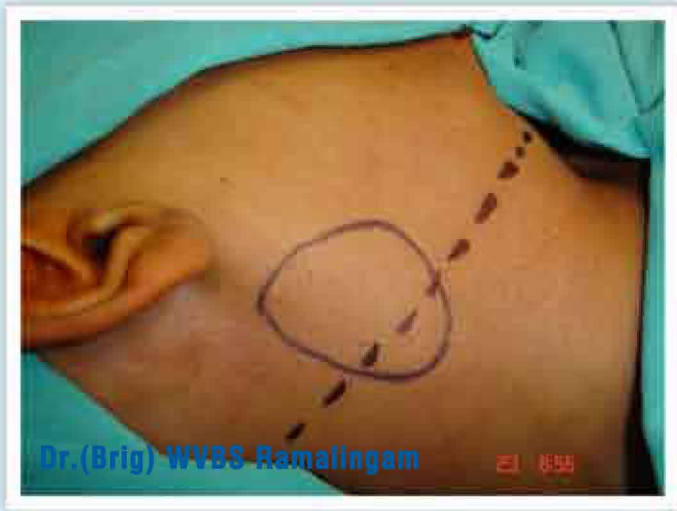
A CASE of GLOMUS VAGALE