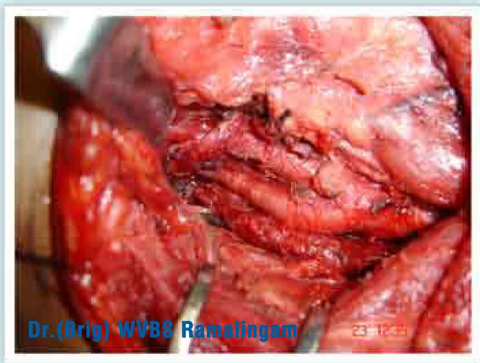
CAROTID ARTERY EXPOSED